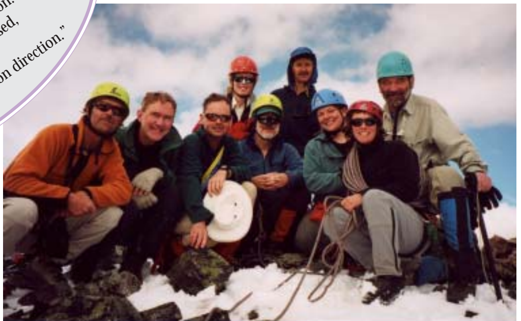
3 rope teams meet on the summit of Outpost.

SECTION SUMMER CAMP, Tonquin Valley, Jasper NP It went well — Thanks to all.